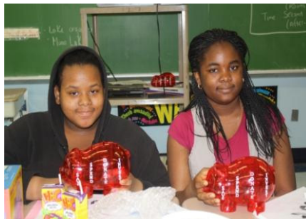
Student participants at I.S. 49. (above photo).

ful way to engage young students in active learning, and SEEK's financial literacy program was well on its way.